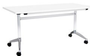
White Pole and Rails