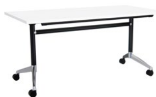
Black Pole and Rails