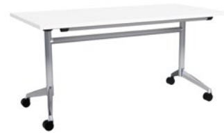
Silver Pole and Rails