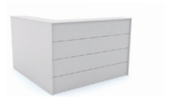
Corner Reception without Top