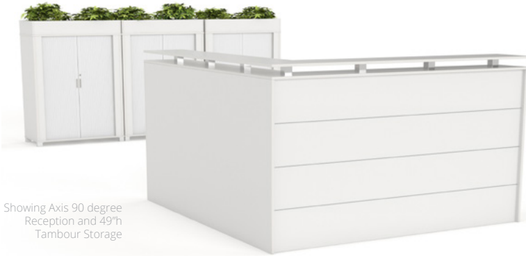
Showing Axis 90 degree Reception and 49" h Tambour Storage