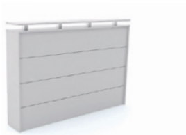
Straight Reception with Top

Straight with Top: 41.5"h x 72.5"w x 12"d