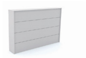
Straight Reception without Top