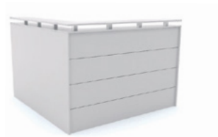
Corner Reception with Top