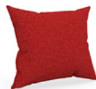
Chilli Red Throw Pillow

For an additional pop of color, try adding throw pillows available in 10 colors!