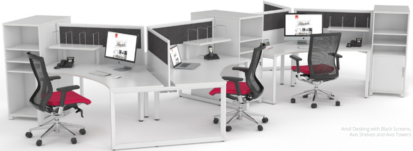
Anvil Desking with Black Screens, Axis Shelves and Axis Towers