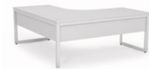
90 Degree Workstation