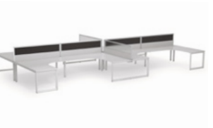
90 Degree Eight Cluster