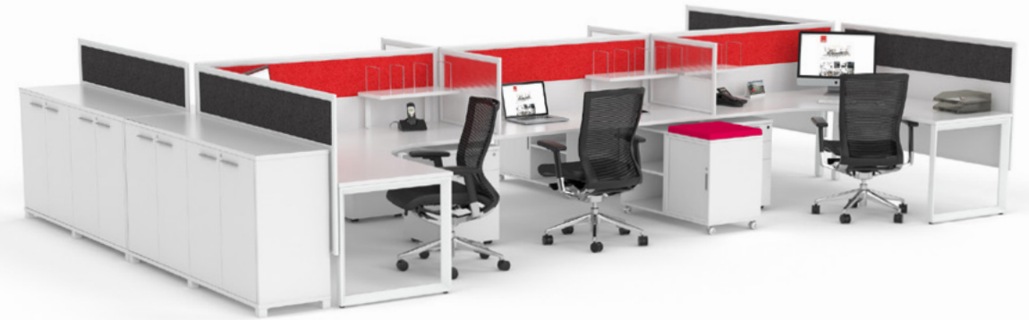
Anvil Desking with Ignite and Black Screens, Axis Credenzas, Deskmounted Shelves, Mobiles and Caddies