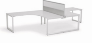
90 Degree Two Pod