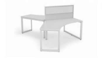
120 Degree 2/3