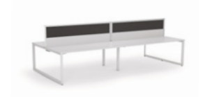
Straightline Two Sided Double