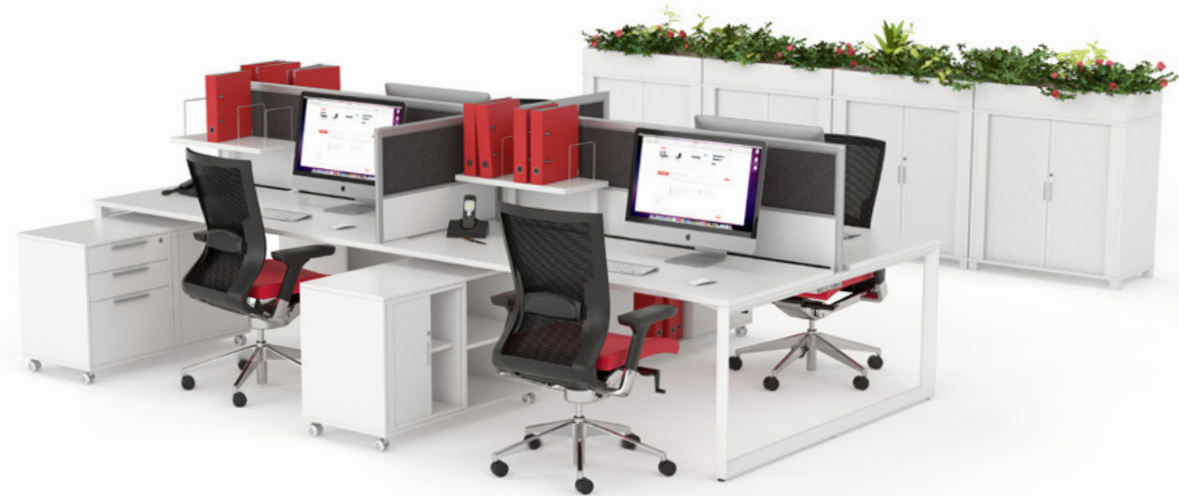
Anvil Desking with Black Screens, Balance Seating and Axis Storage