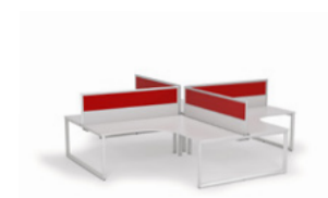
90 Degree Four Pod