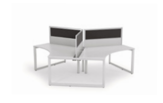
120 Degree Three Cluster