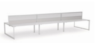
Straightline Two Sided Triple