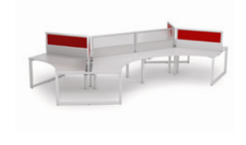
120 Degree Six Cluster