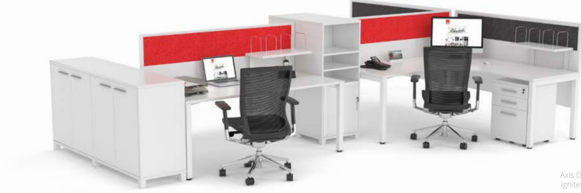
Axis Desking with Black and Ignite Screens, Axis Shelves and Towers