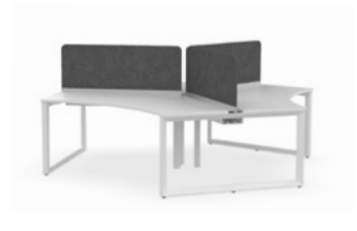
120 Degree Three Cluster