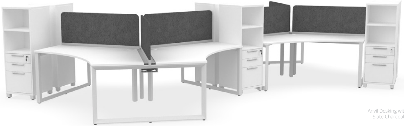
Anvil Desking with Devise Slate Charcoal Screens