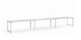
Straightline Single Sided Triple