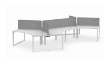
120 Degree Six Cluster