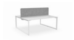
Straightline Two Sided