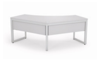
120 Degree Workstation