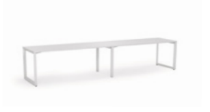
Straightline Single Sided Double