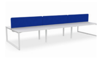
120 Degree 2/3