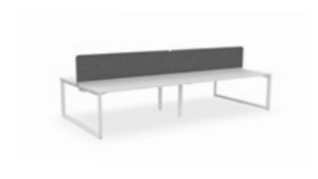
Straightline Two Sided Double