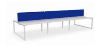
Straightline Two Sided Triple