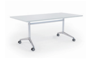
Large White Pole and Rails