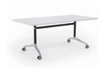
Large Black Pole and Rails