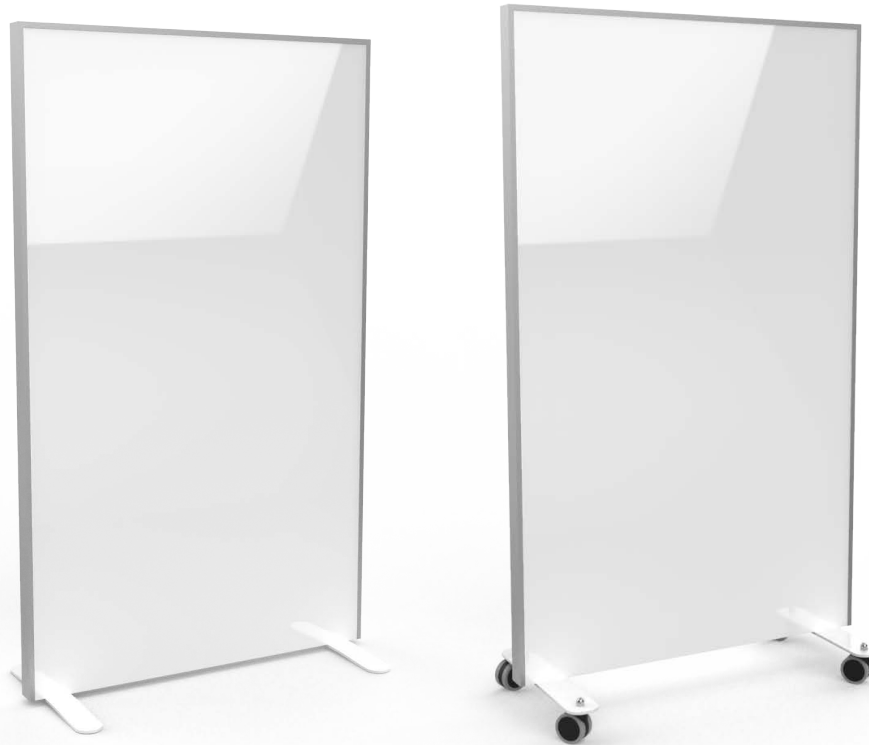
Whiteboard finish shown with standard aluminum frame.