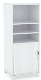
TOWER Bookcase + Tambour