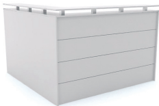
Corner Reception with Top