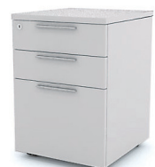
2 DRAWER + FILE 25"h x 16"w x 18"d