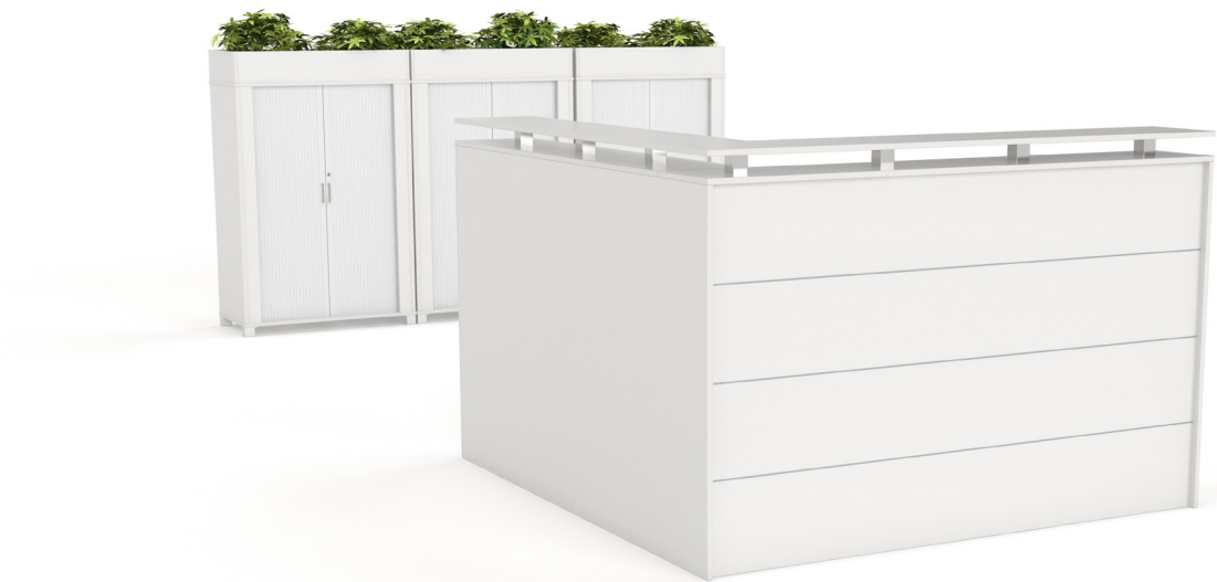
Showing Axis 90 degree Reception and 49”h Tambour Storage