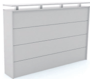
Straight Reception with Top

90° Corner: 48”h x 72.5”w x 72.5”w x 12”d Straight: 48”h x 72.5”w x 12”d