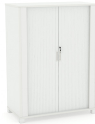
41"h x 36"w x 18"d