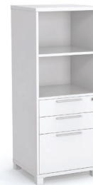
TOWER Bookcase + Drawers