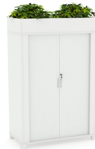
Overall 49"h x 36"w x 18"d Planter 8"h x 36"w x 18"d