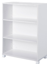
49" HIGH - 3 LEVELS 49"h x 36"w x 12"d