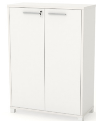
49" HIGH - 3 LEVELS 49"h x 36"w x 16"d