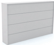
Straight Reception without Top