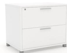
2 DRAWER 29"h x 36"w x 24"d