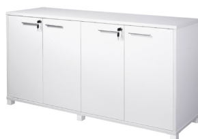
72" LONG - 2 LEVELS 36"h x 72"w x 16"d