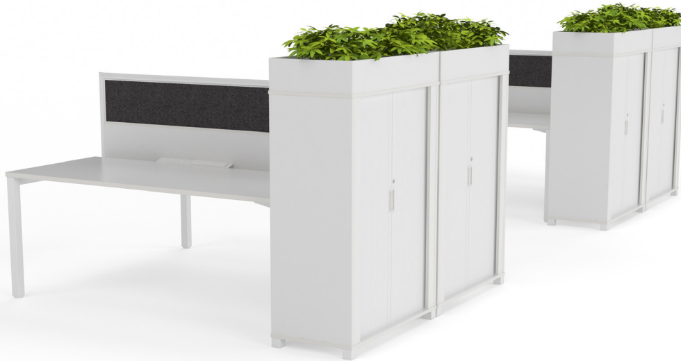
Showing Axis Shared Desks and Tambour Storage