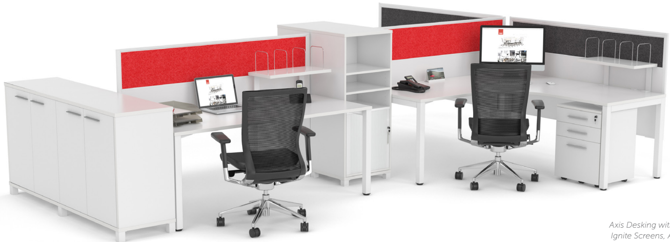
Axis Desking with Black and Ignite Screens, Axis Shelves and Towers