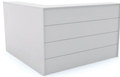
Corner Reception without Top