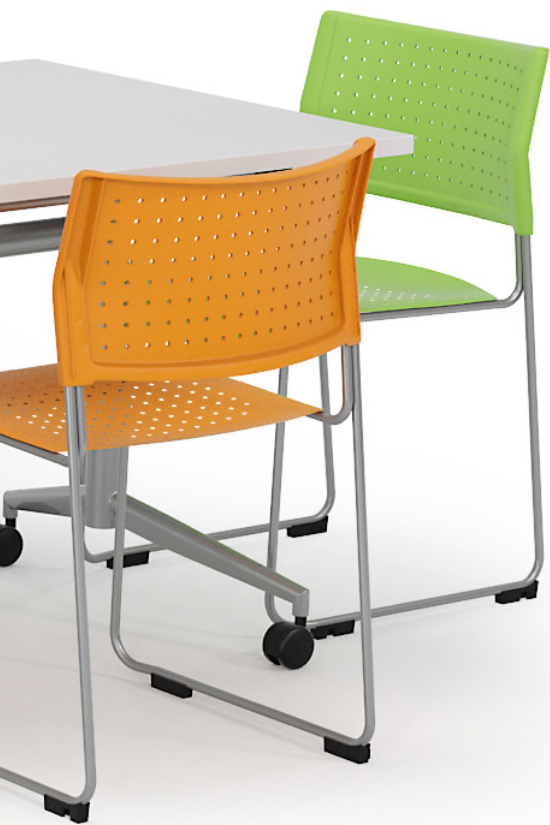
Showing Uni Flip Silver 72"x 30" with mixed colour Link Seating. Orange Link not in stock.