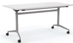
Uni Flip Silver Powdercoat

48"w x 24"d x 28.75"h 48"w x 30"d x 28.75"h 60"w x 24"d x 28.75"h 60"w x 30"d x 28.75"h 72"w x 24"d x 28.75"h 72"w x 30"d x 28.75"h 72"w x 36"d x 28.75"h